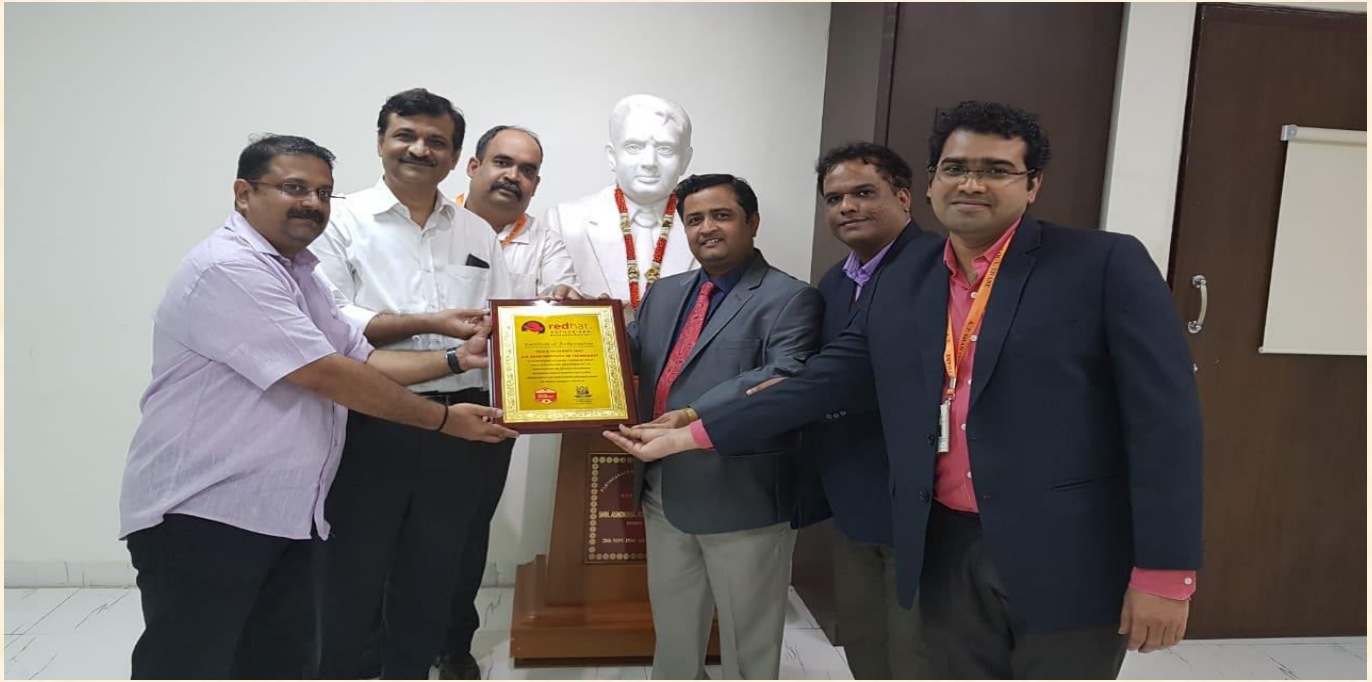
Recognition Of Red Hat Academy Centre