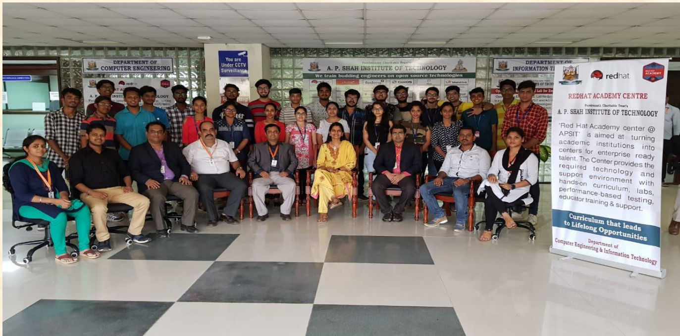
Training Conducted in I Half of AY 2017-2018 on RH 124 & RH 134