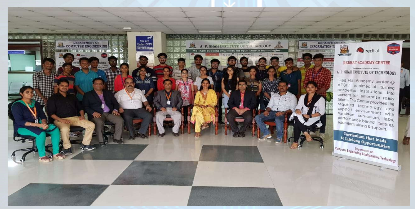
Training Programs Conducted Under Red Hat Academy:

Training Conducted in First Half of AY 2017-2018 on RH 124 & RH 134