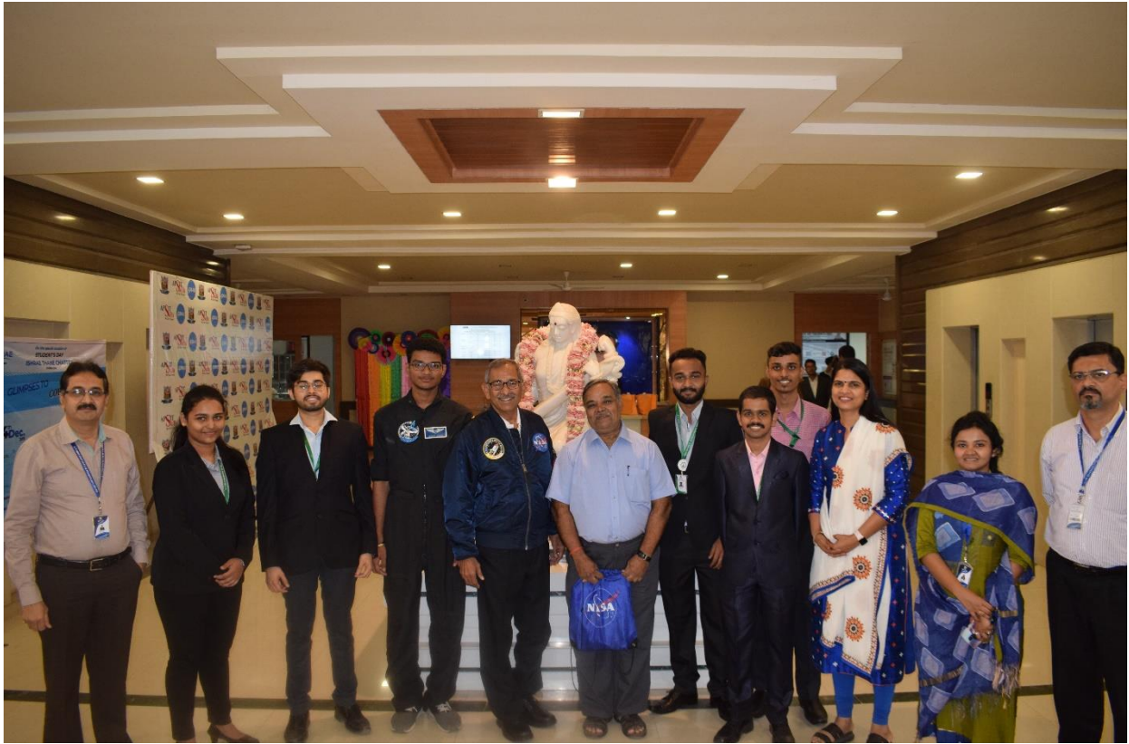
Group photo of MESA Core Committee