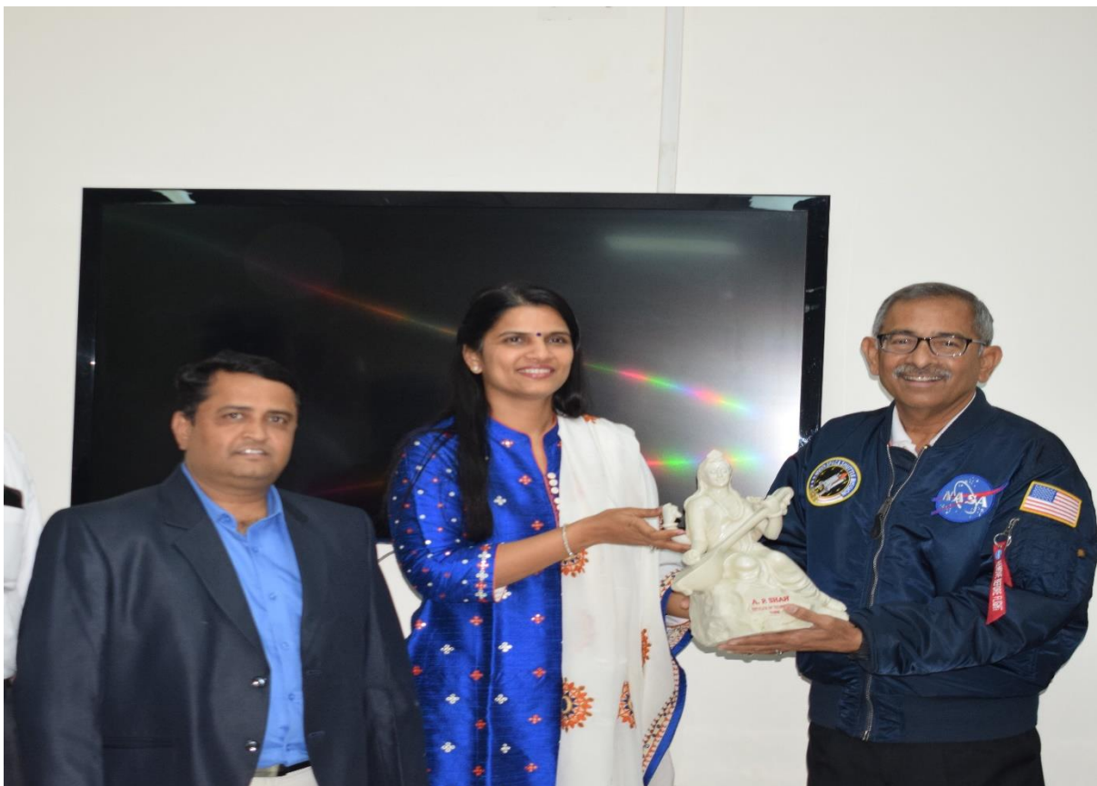
Felicitation of Speaker