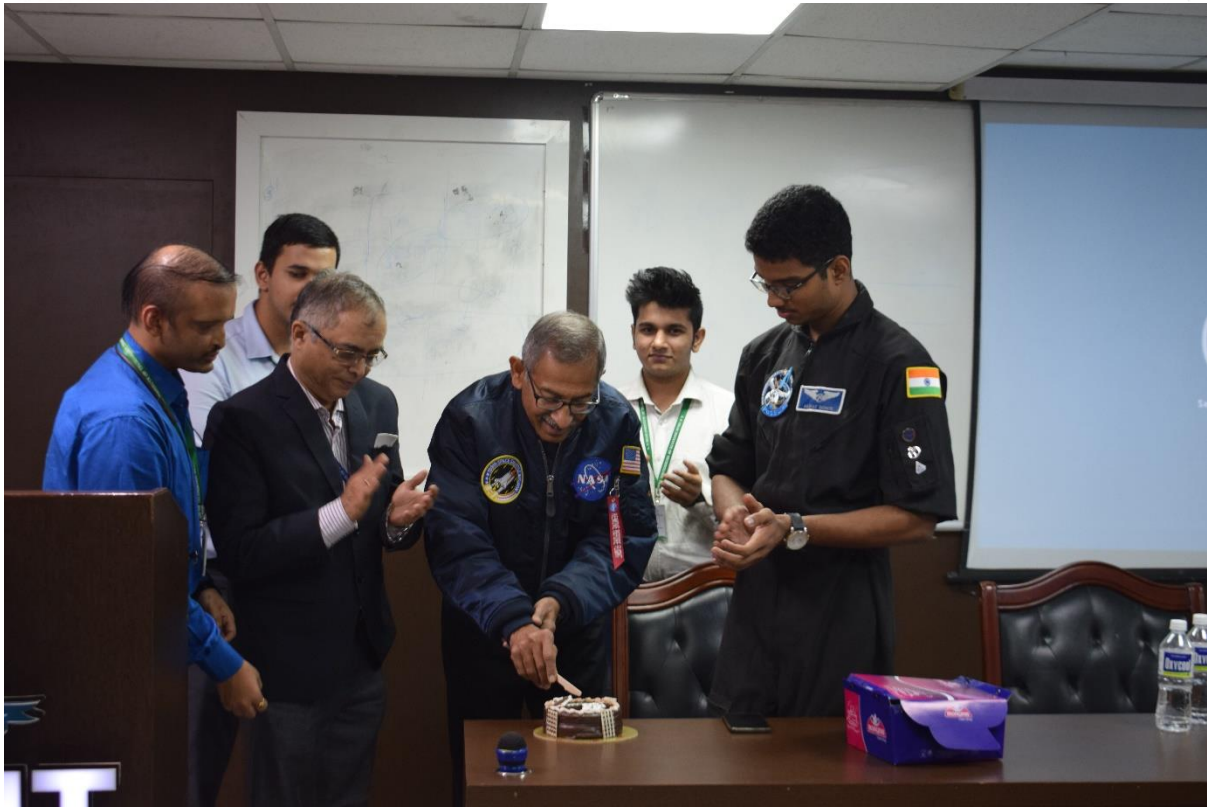
Inauguration of Aero Space Club of APSIT