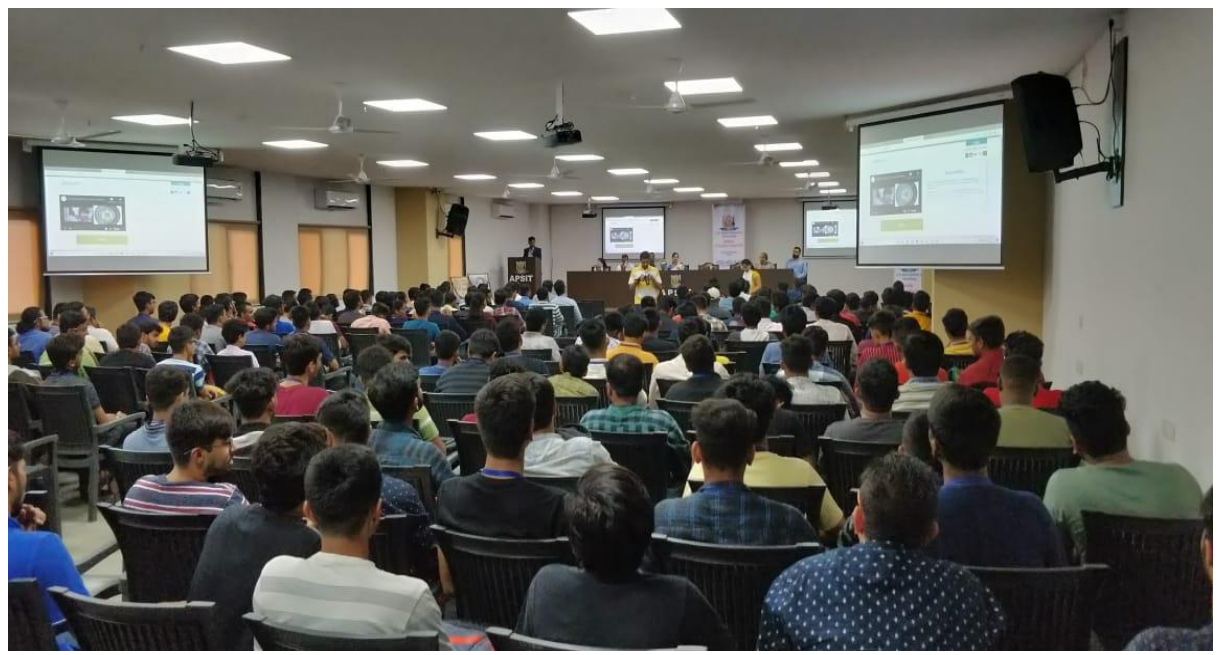
Refrigeration Systems and Green Building

Students attending Tech talk on Eco friendly Refrigerants and Refrigeration systems and Green Building