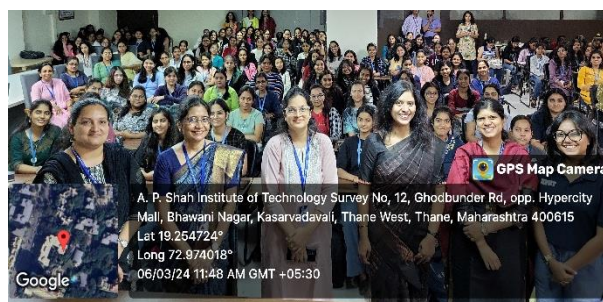
Chief guest with the organizing team and participants