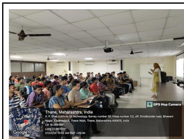
Speaker Delivering the session

The Department of Artificial Intelligence & Machine Learning has organized a “Visual Analytics Beyond Spreadsheets using PowerBI”, PowerBI, a Microsoft product, represents a significant advancement in visual analytics, offering capabilities beyond traditional spreadsheets. Its key features include seamless data connectivity, interactive visualizations, advanced analytics, customization options, and collaboration tools. Through case studies in retail and healthcare, Power BI showcases its ability to drive insights and innovation. This session provided dynamic, interactive, and visually appealing analytics capabilities.