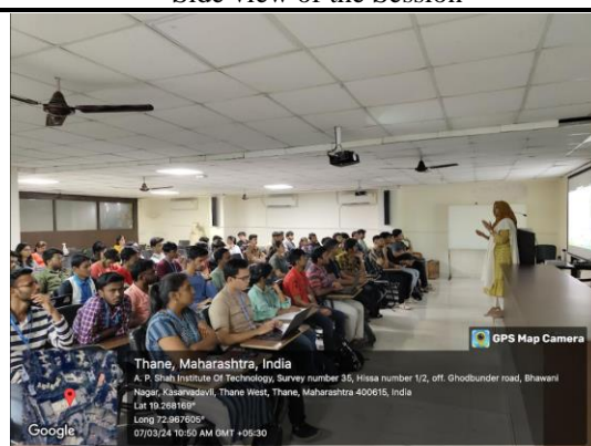
Speaker answering the queries