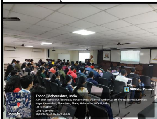
Participants attending the guest lecture