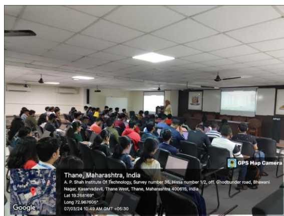
Side view of the Session