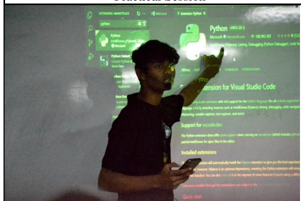
Presentation of the Session