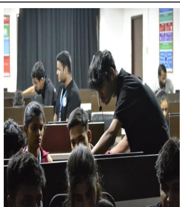
Speaker solving the query of a student