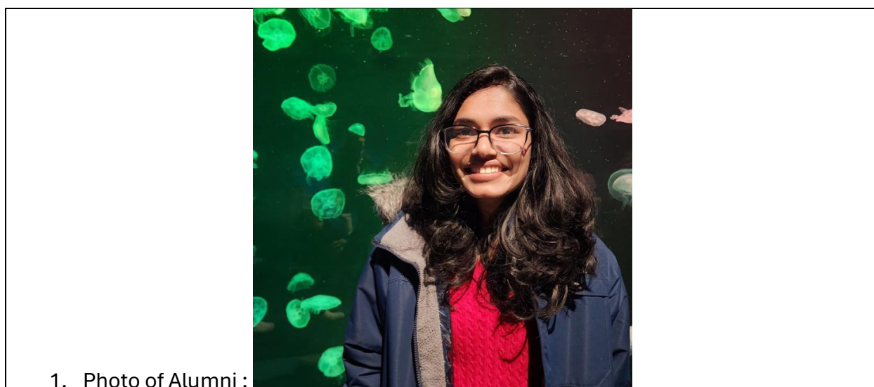
1. Photo of Alumni :